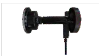
High precision lengthening shaft