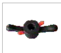
Quick lock nut