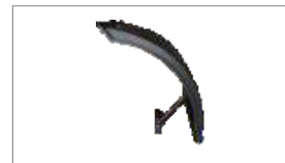
Delicate plastic hood