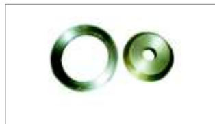
Large centring cone